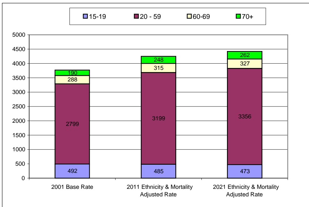
Chart 1 Number of Adults with a learning disability needing individualised health or social care services in Birmingham by age group from 2001 – 2021

Ref: Estimating Future Need/Demand for Supports for Adults with Learning Disabilities in England. Emerson & Hatton, 2004 applied to population from the 2001 Census